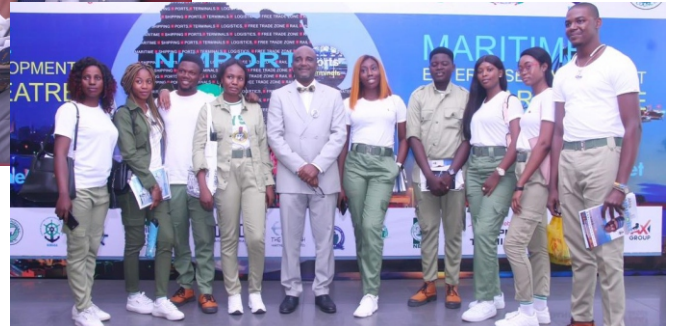
NIMPORT NYSC career support programme.