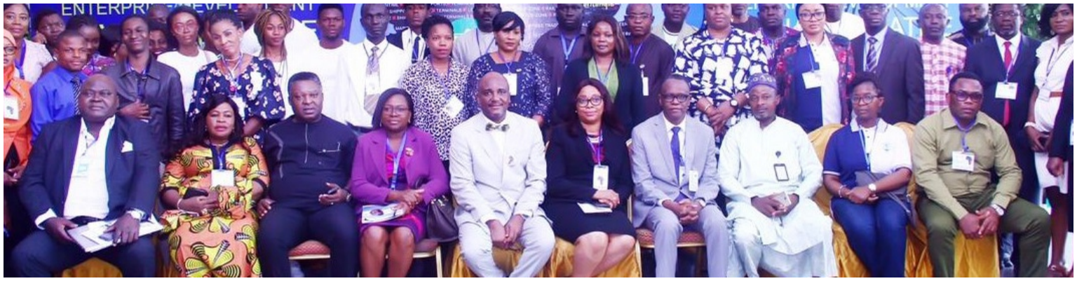
Picture of cross section of participants at the NIMPORT 2019 covering international exhibitors and conference delegates from ports, terminals, logistics, boating and shipping equipment, technologies and services industries.