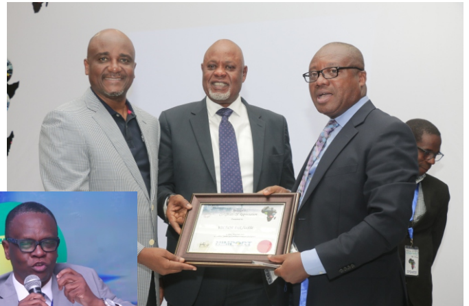
NIMPORT awards for distinguished speakers